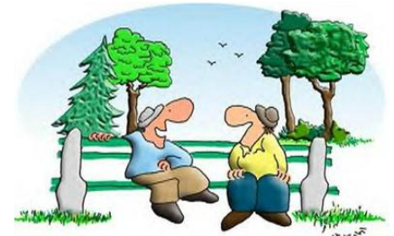
"My doctor told me to avoid any unnecessary stress, so I didn't open his bill."